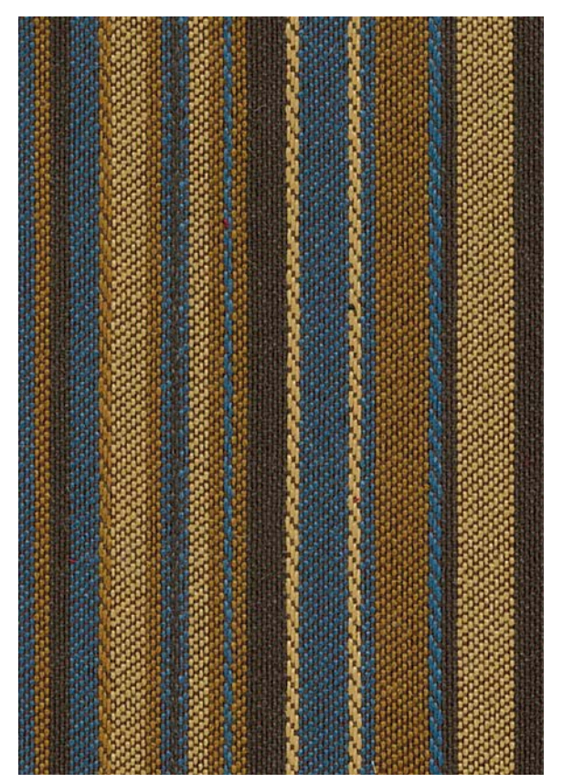
Runway COWBOY BLUE